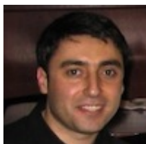
George Bina Syncro Soft